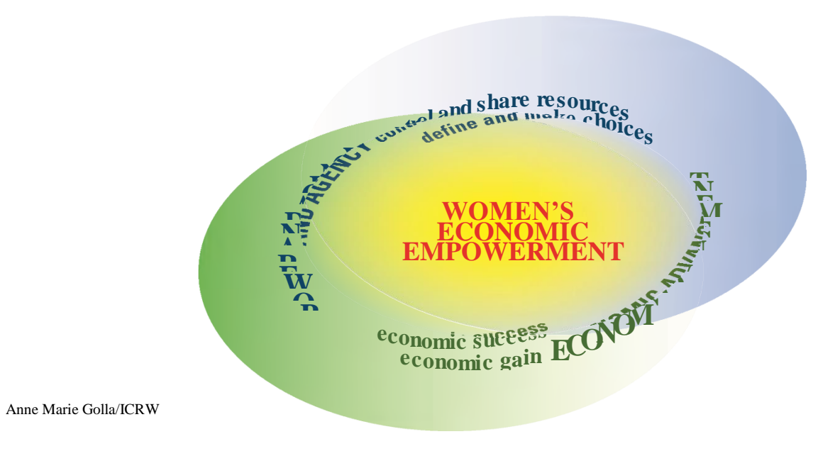
Figure 1: Women's Economic Empowerment

In another definition, Brody et al. (2015), differentiated four main types of empowerments including, (1) economic empowerment which shows that a woman can access resources, can own resources, and is in control of them. (2) Political empowerment shows that she can participate in the decision-making process that relates to resource access, rights to resources, and her entitlement to them in the community. Hence, she must have legal rights and she has the independence to participate in politics (3) social empowerment is a woman's ability to control decisionmaking within the household which is not pecuniary in nature. (4) The fourth type is called psychological empowerment which refers to a woman's ability to choose and practice this choice.